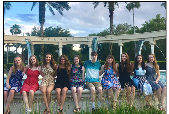
Senior Class Trip to Orlando Florida