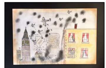
Seth Geiger, Grade 7