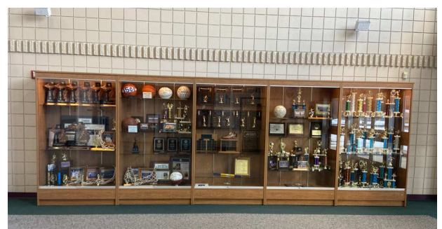
Trophy Case installed by the gym to display all the athletic trophies and awards.