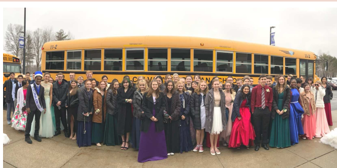
CCS High School loading our new bus for the Homecoming Banquet and activities.