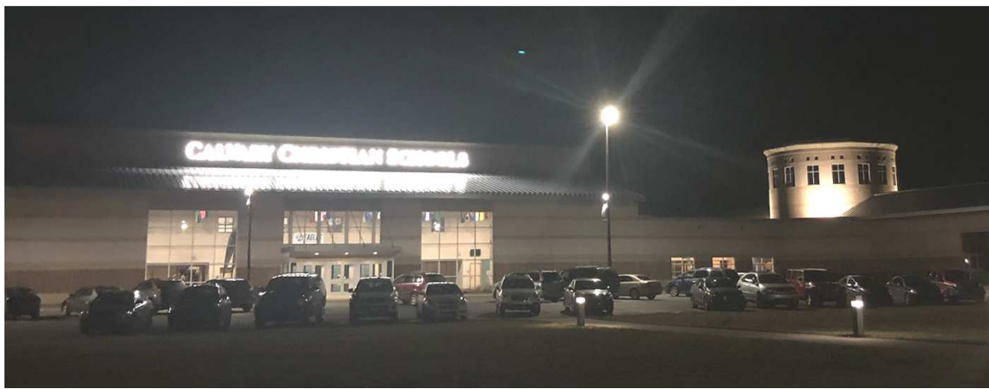
Calvary Christian Schools LED sign shining bright for all to see from the highway.