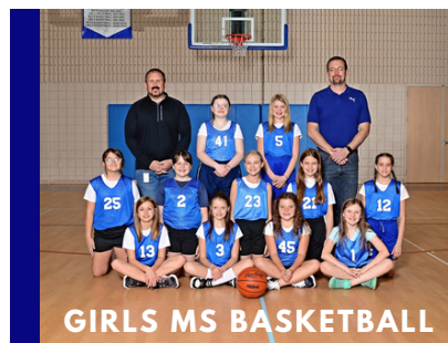
GIRLS MS BASKETBALL