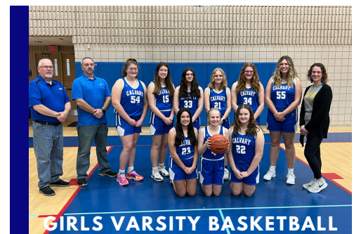
GIRLS VARSITY BASKETBALL