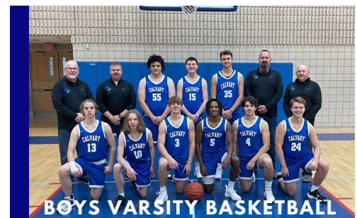
BOYS VARSITY BASKETBALL