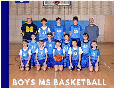
BOYS MS BASKETBALL