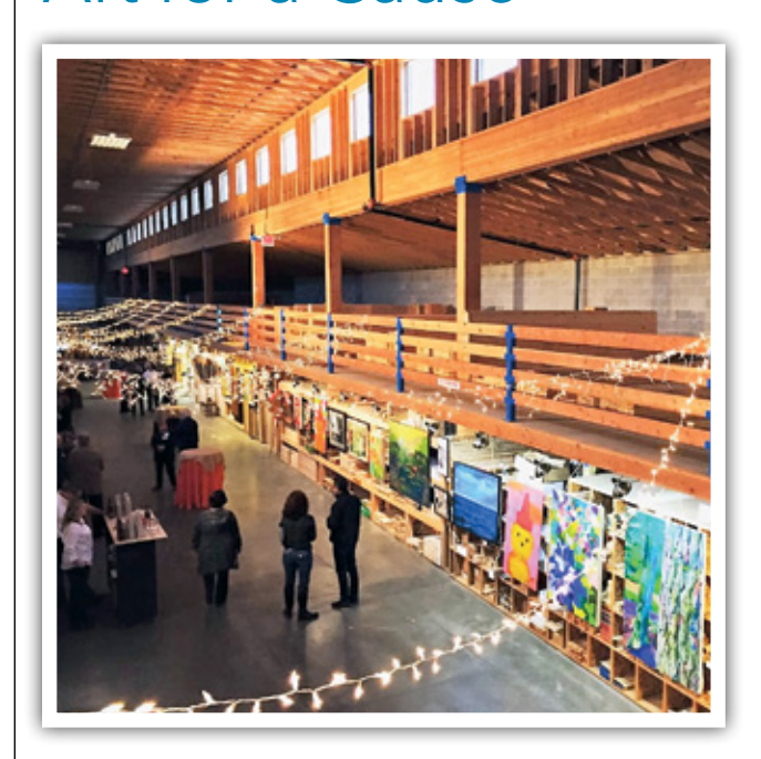
The final setup before hundreds of guests arrived for the 2015 Art at the Yard event.

On October 24, 2015, twenty artists came together to showcase their talents and help support the Grand Haven Schools Foundation. This first-time event, called Art at the Yard, was sponsored by the Tri-Cities Kiwanis and hosted by Baker Lumber in their spectacular new warehouse.