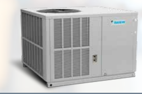
Packaged Unit Models DP13HM, DP13CM, DP13GM