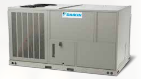
Packaged Unit Models DCC, DCG, DCH (7 ½ - 12 ½ Tons)

Harnessing energy-efficient performance, proven technology, and enhanced Comfort for Life.