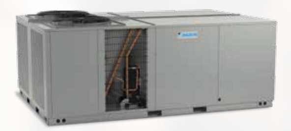
Packaged Unit Models DCC, DCG (25-Tons)