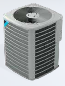
Split System Air Conditioner Models DX13 , DX11 Split System Heat Pump Models DZ13 , DZ11