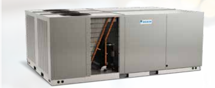
Packaged Unit Models DCC, DCG (15 & 20 Tons)