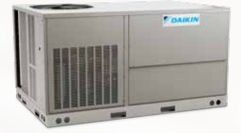
Packaged Unit Models DCC, DCG, DCH (3 - 6 Tons), DT Series (3 - 5 Tons)